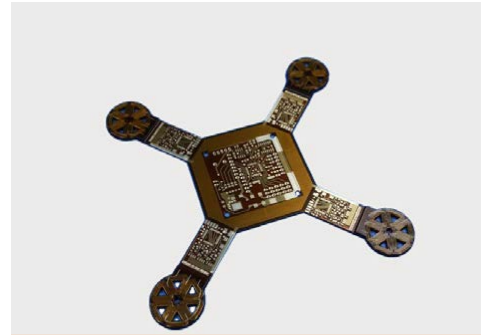
Figure 4: AME drone

To facilitate the above-mentioned integration of mechanical and electrical functionalities in one single structure, it will be necessary to print the whole AME structure in one single print. This leads to additional advantages on the electronic design side since it will no longer be necessary to interconnect different structures, but it will be possible to omit connectors and connecting wires between the devices. Instead, the required connections between different sections of the AME structure can just be printed and therefore do not need any additional assembly steps.