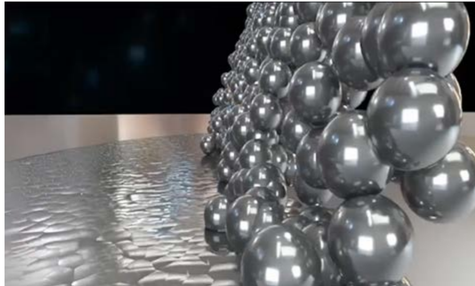
Figure 1: Silver nano particles ink for conductive features

The Nano Dimension process enables the realization of three-dimensional electronic devices, which completely overcome the design limitations imposed by the traditional PCB manufacturing process. It is possible to assign each printed three-dimensional voxel to be conductive or nonconductive during the design process.