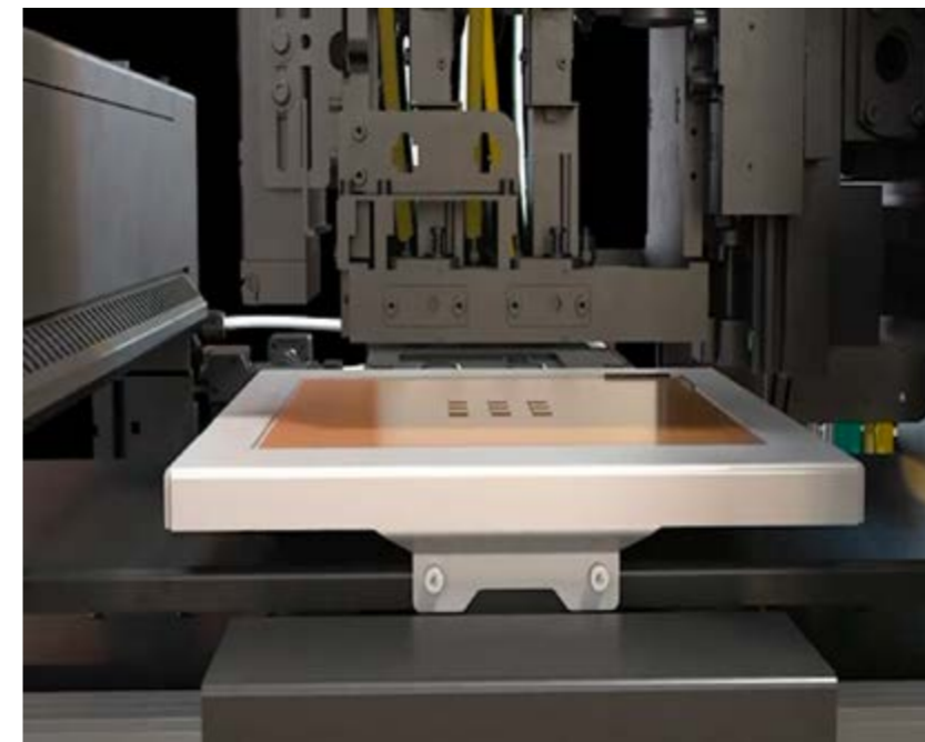
Figure 2: Polymer based ink for insulation and structure

The purpose of this document is to show potential applications and use cases that could vastly benefit from the newly available AME technology. In chapter 2, a list of nontechnical benefits of the AME technology over the traditional PCB process will be presented, while the remaining chapters will show some purely technical USPs of the AME technology. Although these USPs are listed separately in this document, it is certainly possible to include them all together in one single structure in order to draw the most benefit from using the AME technology. Nevertheless, the provided list of USPs is not complete. The basic idea of the J.A.M.E.S platform is to assemble as much AME knowledge as possible. Therefore, anyone who has additional USPs, which were not mentioned in this document, is welcome to share their ideas and experiences on the J.A.M.E.S platform.